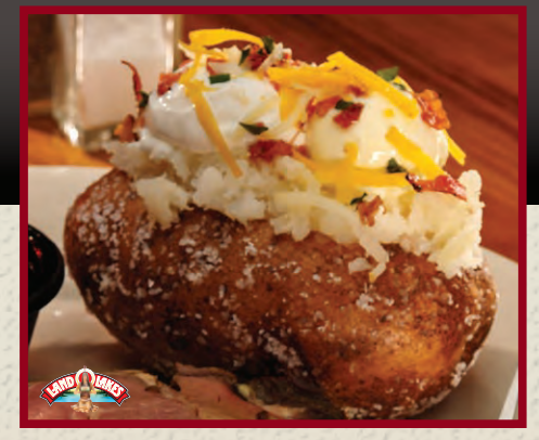
Loaded Idaho Baked Potato