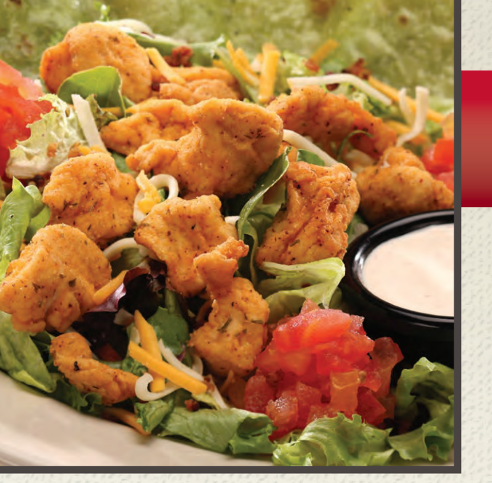
Sagebrush Signature Salad