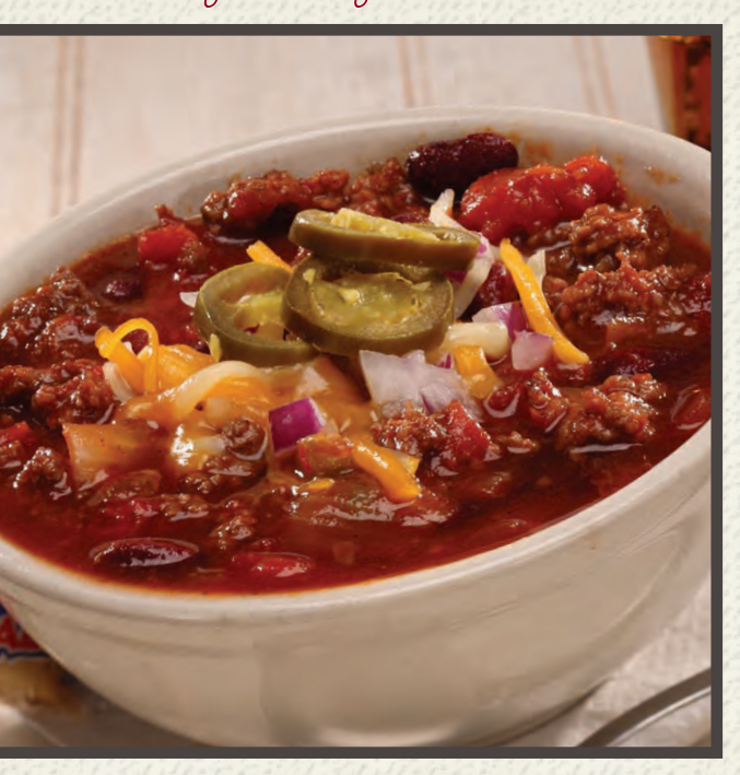
Award Winning Chili