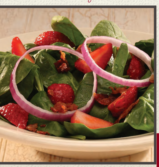
Spinach Side Salad